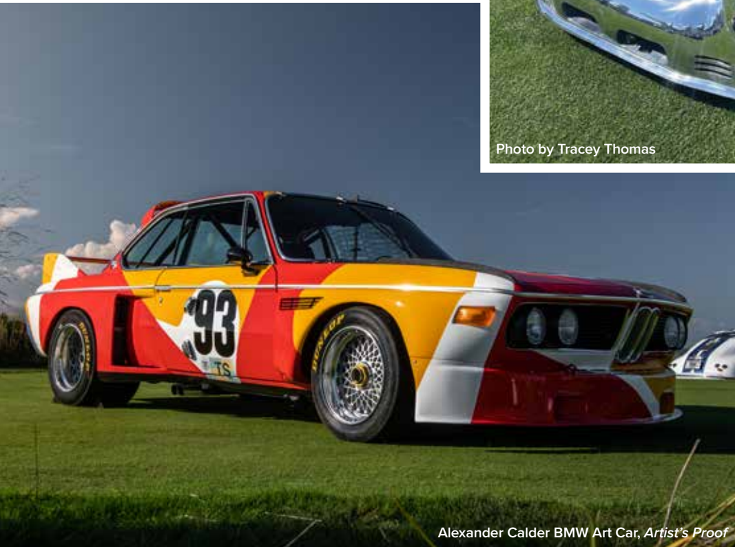
Alexander Calder BMW Art Car, Artist's Proof

Returning for its fourth year as presenting sponsor is Richard Mille, which in keeping with the theme of the day, spotlighted two of its automotive-inspired watches, both introduced in 2021: the RM 40-01 Automatic Tourbillon McLaren Speedtail and the RM 029 Automatic Le Mans Classic.