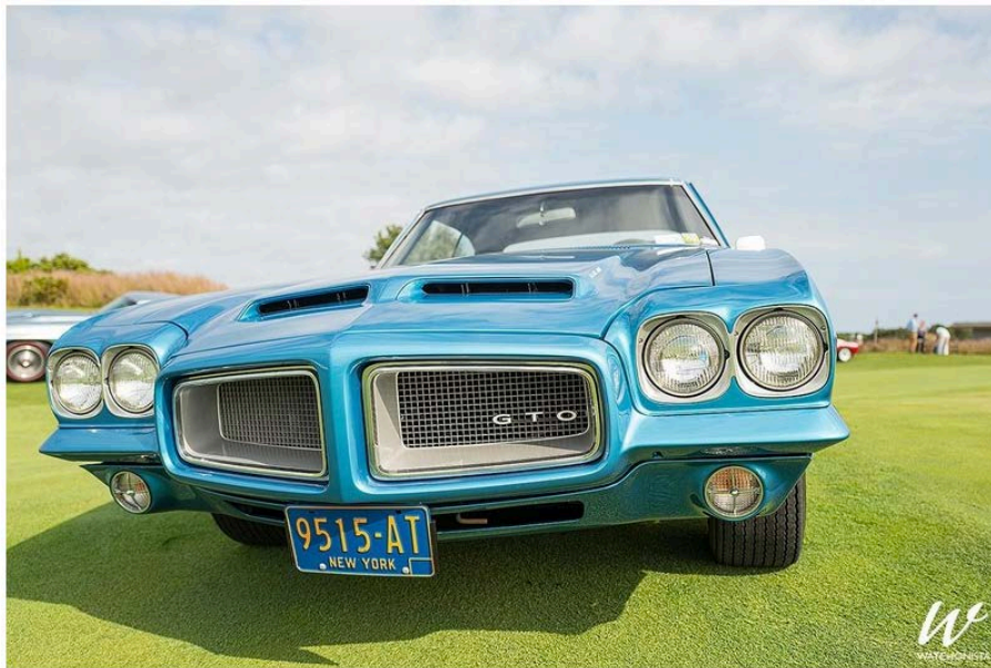
1967 Pontiac GTO