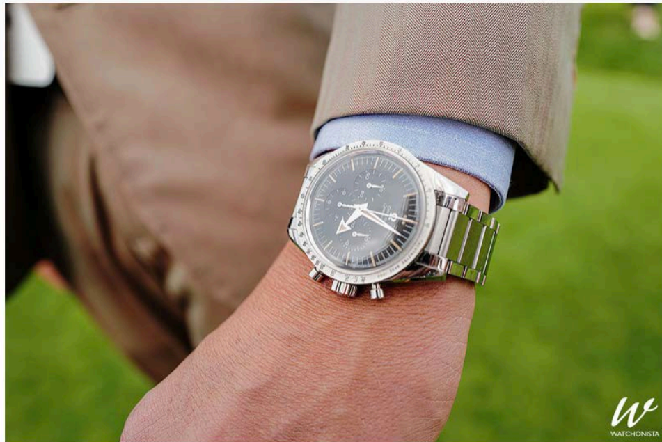
Omega Speedmaster 60th Anniversary Limited Edition