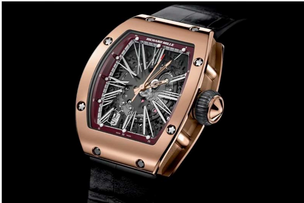
Richard Mille RM 023