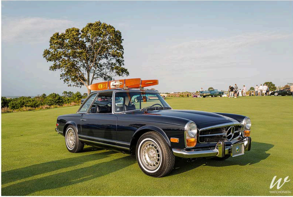
The Bridge IV, The Hampton's Most Exclusive Car Show