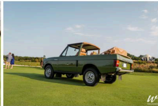
The Bridge IV