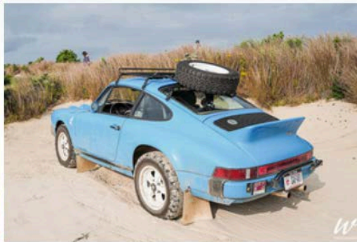
The Bridge IV