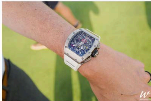
Richard Mille RM 11-03 Automatic Chronograph