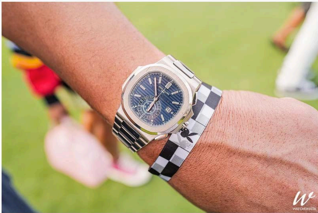
Patek Philippe Nautilus Chronograph Ref. 5976/1G 40th Anniversary Limited Edition