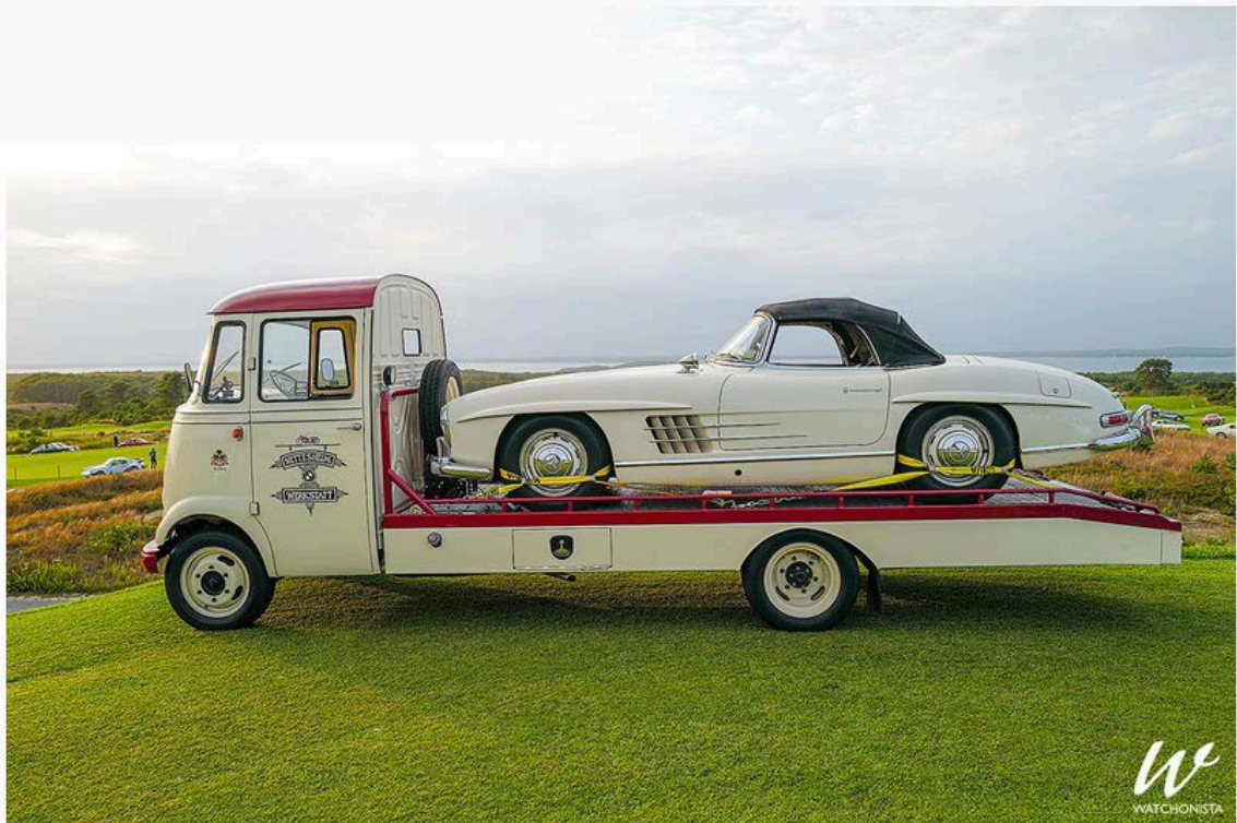
Mercedes Benz 300 SL on rescued