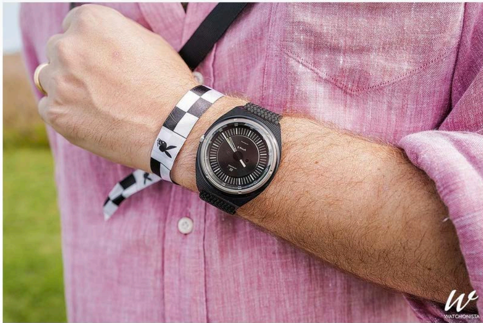
Automodro Group B Series 2 Automatic