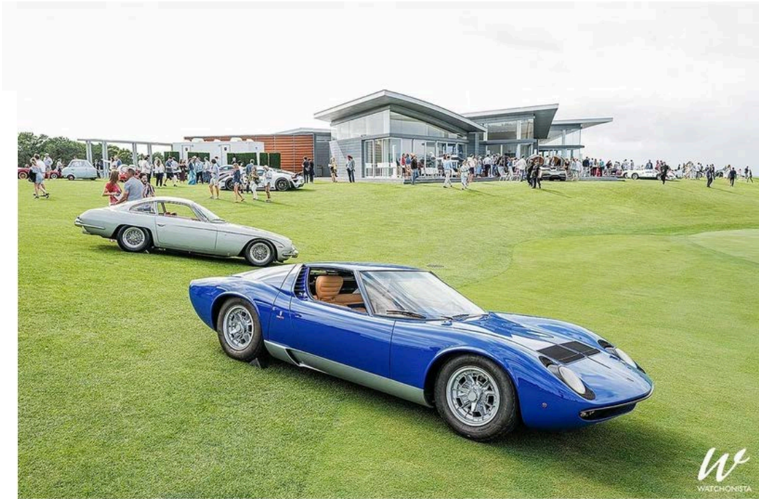
The Bridge IV, The Hampton's Most Exclusive Car Show