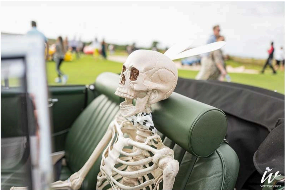
See You Next Year For The Fifth Edition!