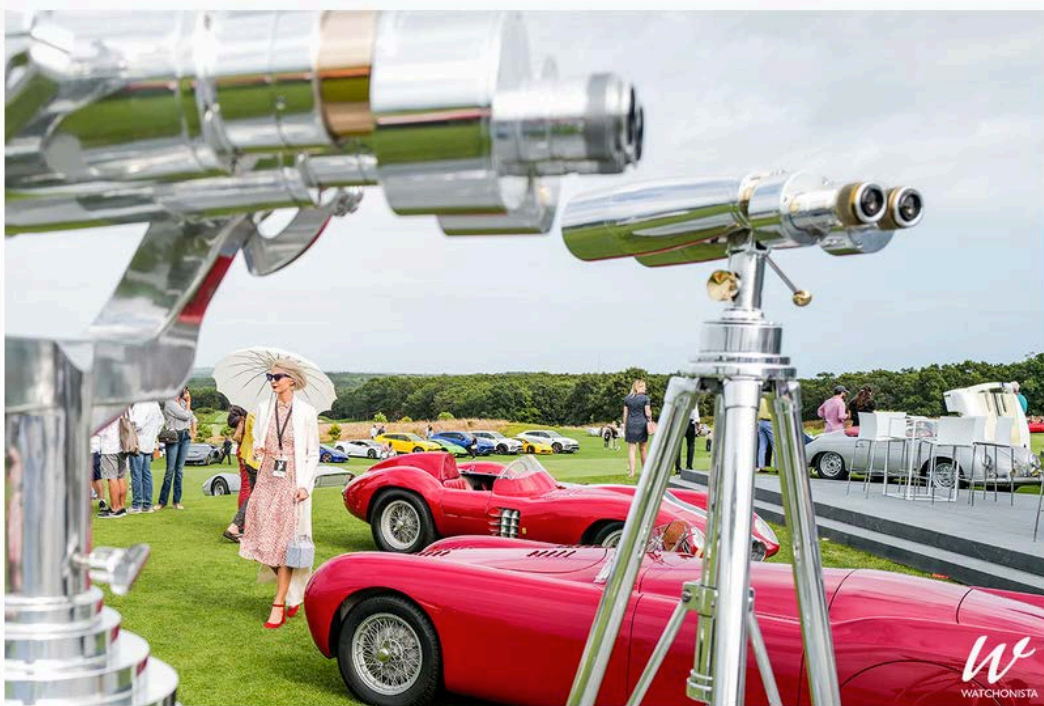
The Bridge IV, The Hampton's Most Exclusive Car Show