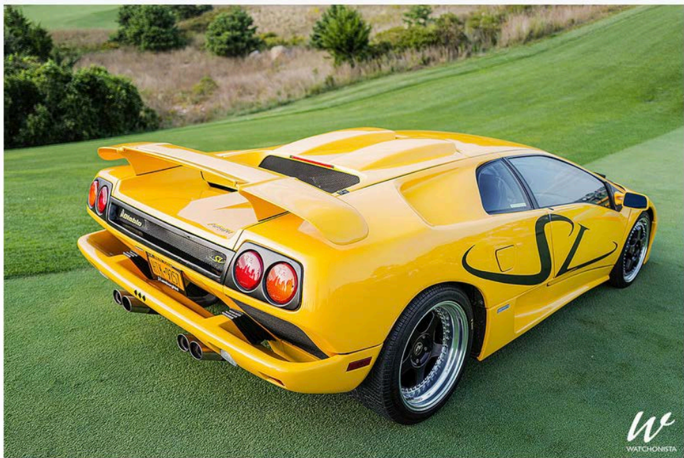
Lamborghini Diablo SV