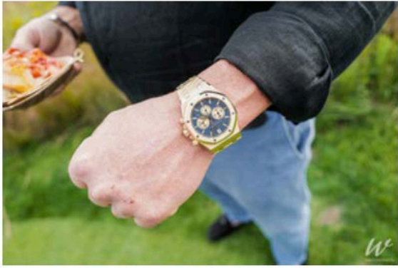
Audemars Piguet Royal Oak Selfwinding Chronograph