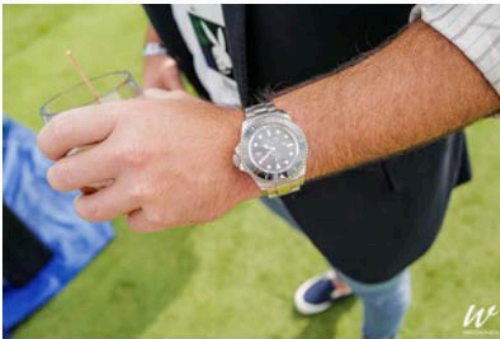
Rolex Deep Sea