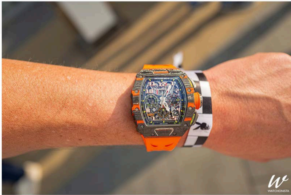
Richard Mille Manual Winding Tourbillon Split-Seconds Chronograph McLaren F1