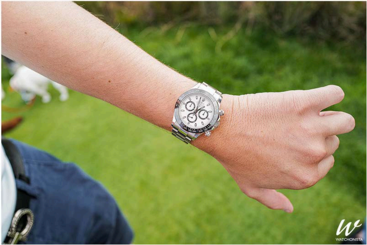
Rolex Oyster Perpetual Cosmograph Daytona