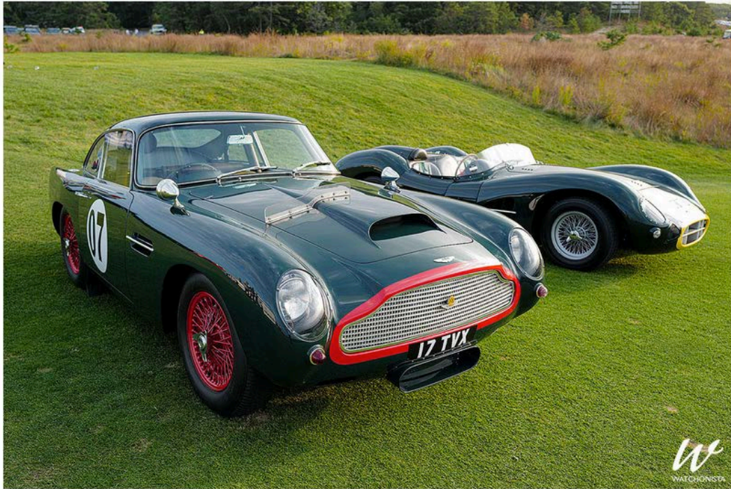
The Bridge IV, The Hampton's Most Exclusive Car Show