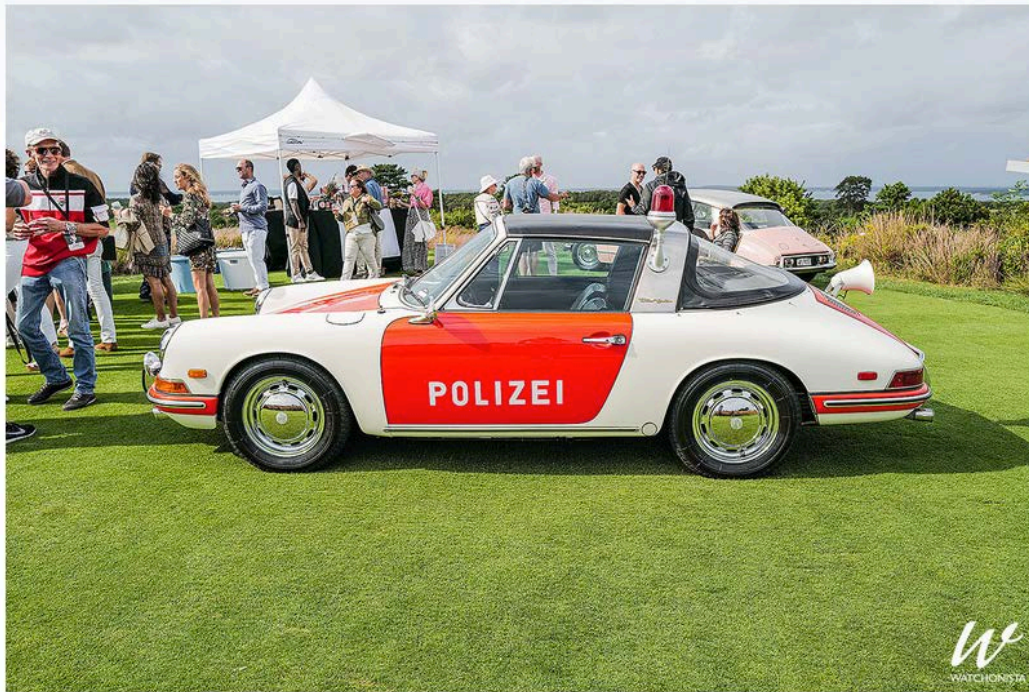
Porsche 911 Targa "Polizei"