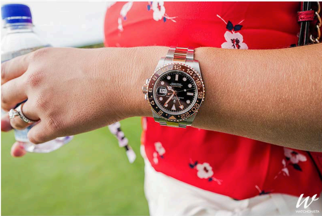
Rolex GMT Master II CHNR (aka Root Beer)