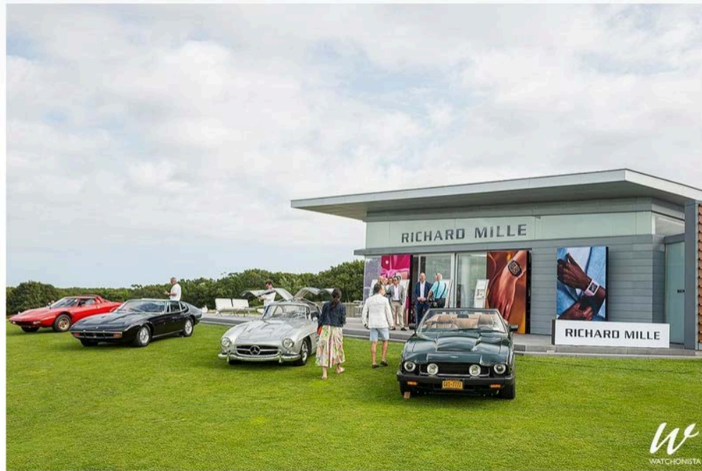
The Bridge IV, The Hampton's Most Exclusive Car Show

Watchonista previously attended The Bridge with our friends Richard Mille. However, for this year's fourth edition, we decided to attend as car lovers. Luckily, we brought our cameras along to document this experience. Over 260 cars (and their owners) gathered from around the world. From a jaw-dropping McLaren Senna to a mightily impressive number of Lamborghinis and even a Volkswagen Herbie replica, The Bridge had it all.