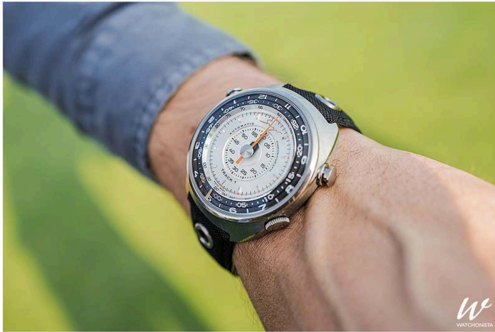
Singer Reimagined Track1