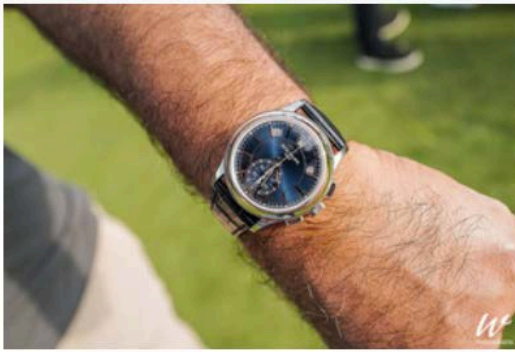
Patek Philippe Ref. 5207G