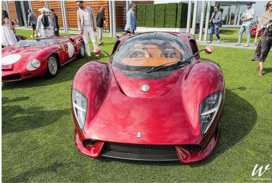
De Tomaso car