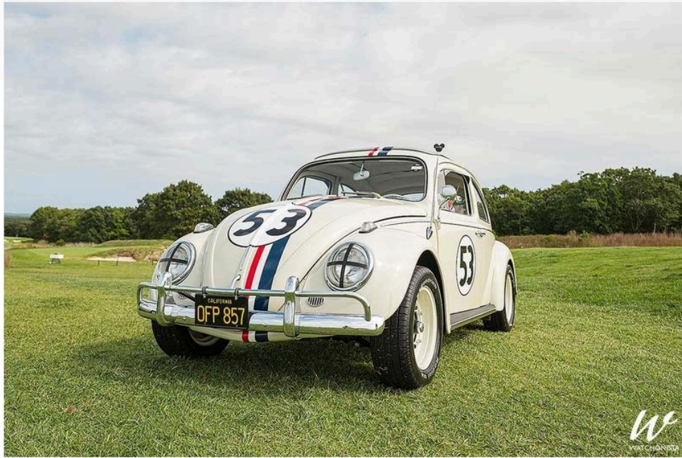
VW Beetle Herbie