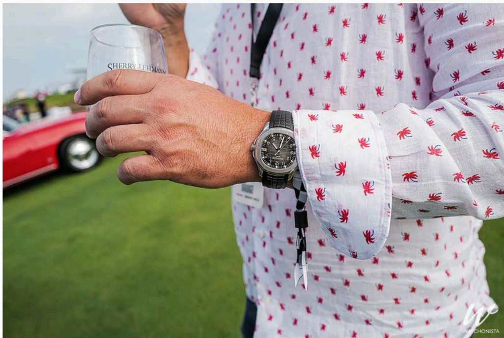
Patek Philippe Ref. 5168G Aquanaut "Jumbo"